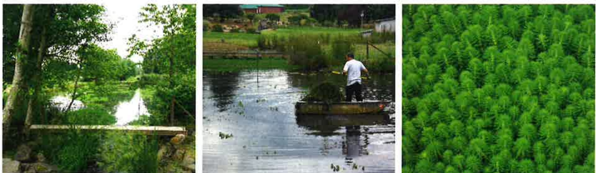
The parrot feather infestation upstream of the Beavercreek Farm, spreading propagules downstream.