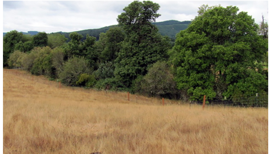
▲ Fence livestock away from streams.