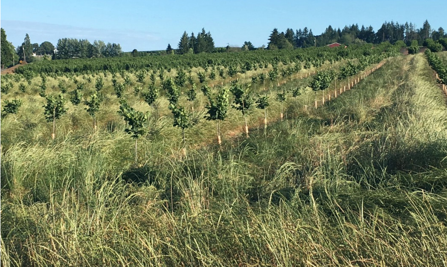
▲ Grass between orchard rows helps prevent leaching and runoff of fertilizers.