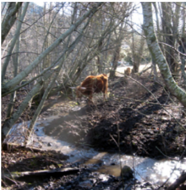
▲ Fences are needed to keep animals from waterways.

Agricultural Water Quality Management Area Plans (Area Plans) address agricultural water quality issues in Oregon. As the LACs helped create the Area Plans, they also helped write Area Rules (regulations) for that Management Area. The Area Rules ensure that all landowners do their part to prevent and control water pollution. The Program is designed to help anyone engaged in agricultural activities prevent water pollution.