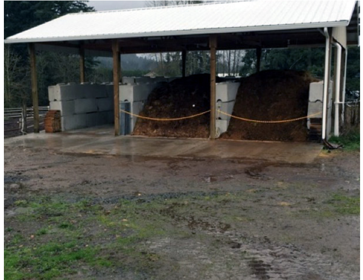
▲ Manure is stored on a concrete pad under cover.