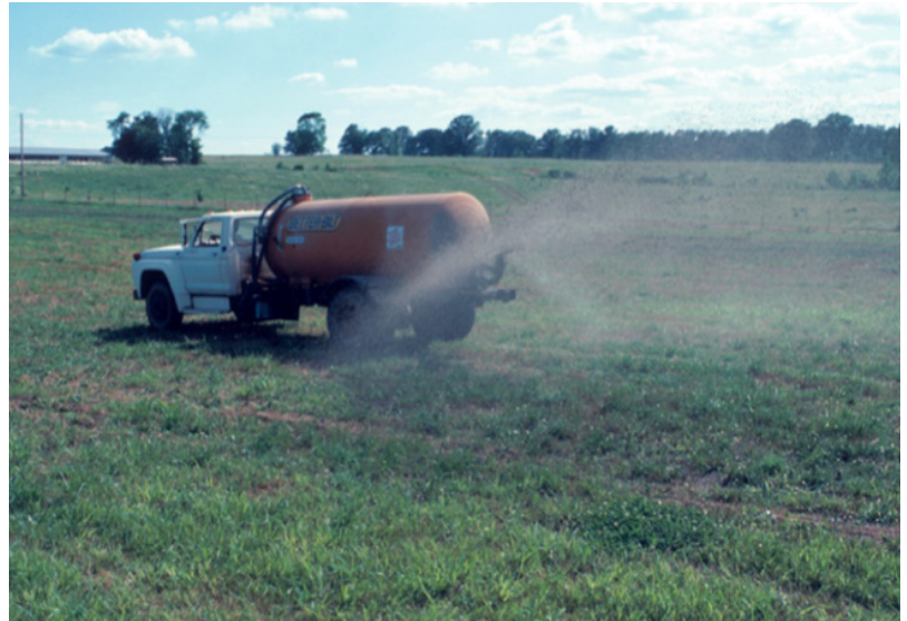
▲ Apply crop nutrients in such a way that they do not enter streams.