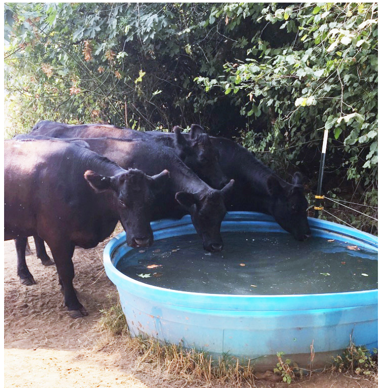
▲ Water is held in a tank as a drinking-water source for livestock.