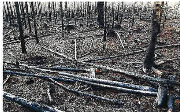
Younger replanted forest stands represent a total loss, with typically higher burn intensity and greater mortality, with no options for salvage operations.