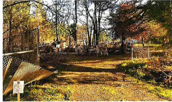
Several homes, vehicles, and out-buildings were lost in the Dodge and Elwood areas in the Clear Creek drainages of the Clackamas.