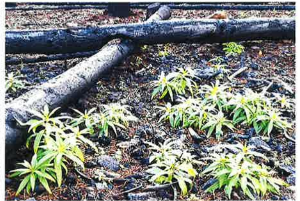
All is not lost. Many native plants are also responding following the fires including native fireweed. Native ground cover will help to protect exposed soils.