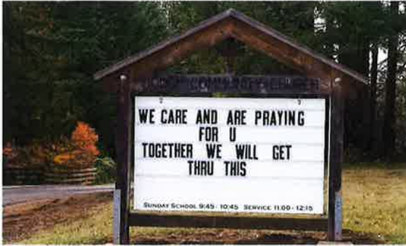
The marquee at the Dodge Community Church is the last structure standing on the property.