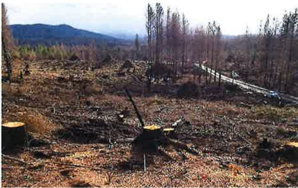
Salvage logging operations are underway across the county. Industrial timber lands were 92% of the state and private lands impacted by the Riverside fire.