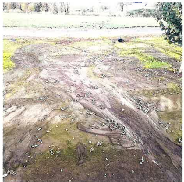
Example of soil erosion from video shoot.