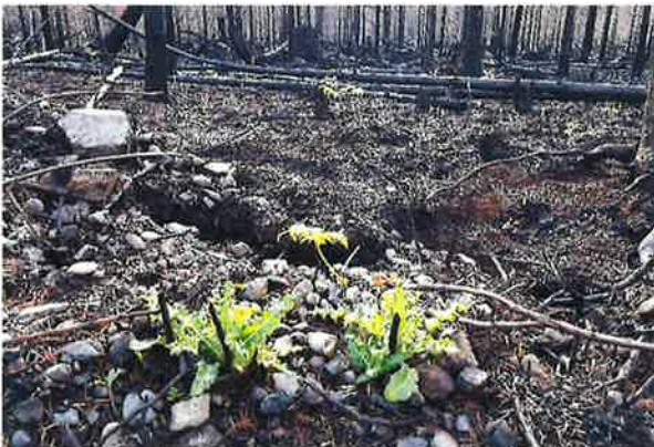
Emergent weeds, like Canada thistle, blackberry, tansy ragwort, false brome, herb Robert, and shining geranium are going to see significant expansion in the coming years.