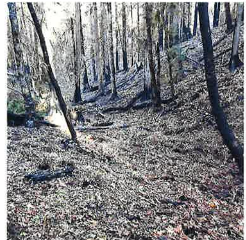
Wildfire damage seen on a recent site visit.

Over the past two months there has been an abundance of information distributed from multiple agencies concerning resources and advice for landowners that need assistance recovering from the fires. After the wildfires, the planning team expected to get inundated with calls from folks needing help on burnt areas. However, so far, the planners have worked with about ten landowners that need assistance on their landscape resulting from the fire, which is less than we expected. We have learned that most of the fire damage occurred on federal, state, and industrial forestland. Nevertheless, to be best prepared to help, the planners have been working on combining the various information from different agencies into a centralized document. We intend to work with the outreach team soon to create a helpful fact sheet to use when visiting with fire affected landowners.