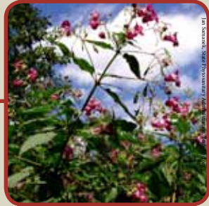
Clockwise from upper left: Policeman's helmet seeds and exploded fruit, close up of spurred flower, Large policeman's helmet plant in full bloom, Leaves and stem of policeman's helmet.