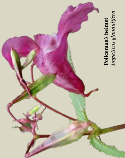
Policeman's helmet Impatiens glandulifera