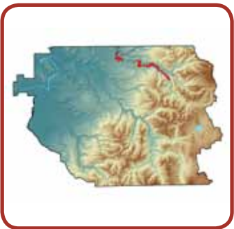
Policeman's helmet locations in Clackamas County The red dots depict the known policeman's helmet locations.

⊙ Be patient and diligent. Understand that controlling and preventing the reinfestation of policeman's helmet is a long term process.