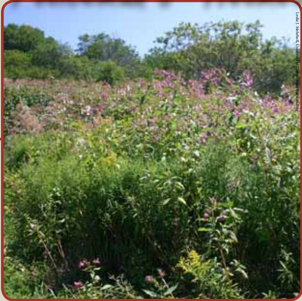
Above: A large Policeman's helmet patch