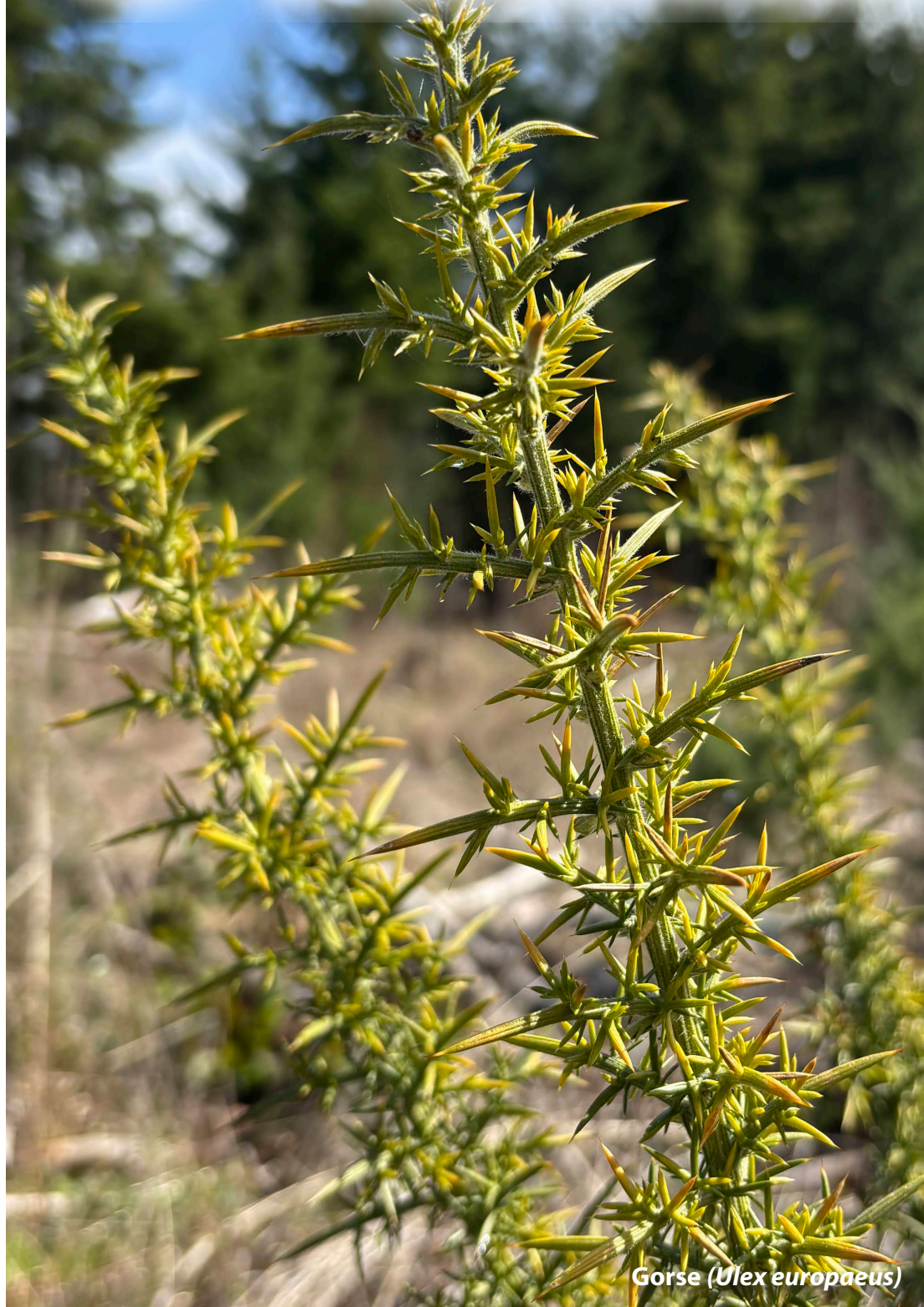
Gorse ( Ulex europaeus )

A conservation program of the Clackamas SWCD