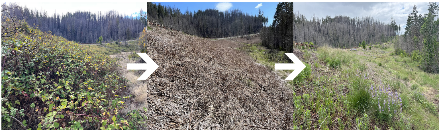
Before, During, and After: The WeedWise has been managing many fire-adapted weeds within the wildfire burn areas in Clackamas County. This large infestation of blackberry on the Mt Hood National Forest was treated to manage the weeds and was reseeded with native grasses and forbs provided by the US Forest Service. The result of this effort speaks for itself!