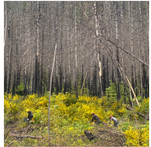
Management of fire-adapted weeds continues in fire impacted areas continues in Clackamas County.