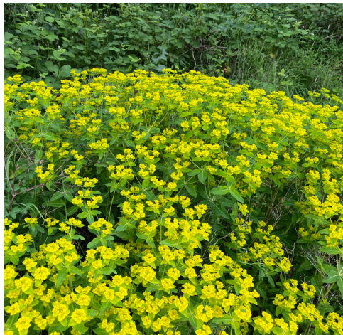
A new massive infestation of oblong spurge was discovered along the Clackamas River this season.