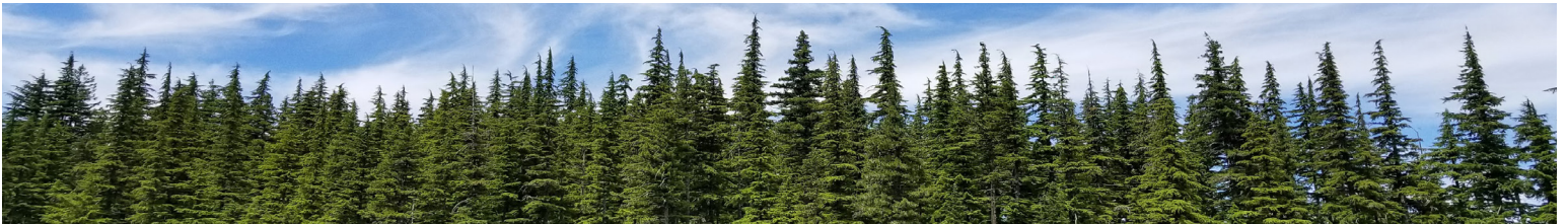
Protecting Beautiful Places: Much of our focus is on protecting the beautiful natural areas of Clackamas County.