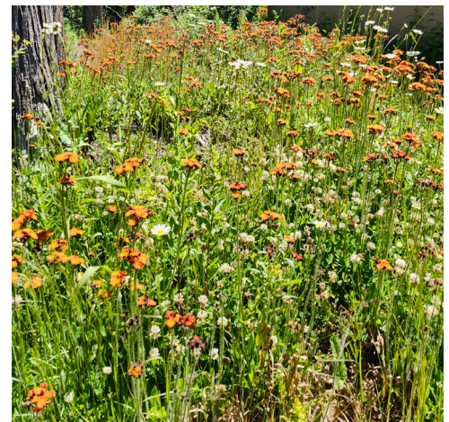
New orange hawkweed patches were discovered as part of our Wildland Urban Interface (WUI) management.