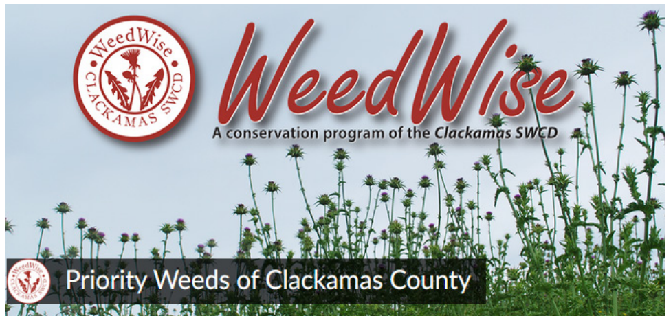
This year we continued our priority weed project on iNaturalist which has captured 621 priority weed observations of 33 different species.