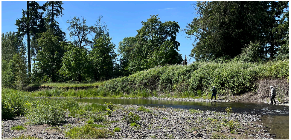
With a grant from the Oregon State Weed Board, the Molalla River was targeted for survey and treatment of an emergent and growing garlic mustard infestation.

If you are working to control invasive weeds on property that you own or manage please contact the WeedWise program for assistance today!