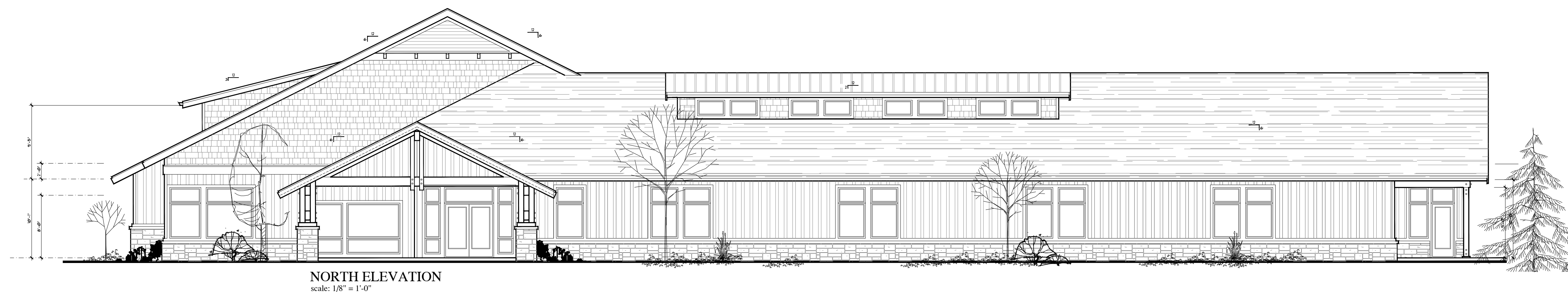
NORTH ELEVATION scale: 1/8" = 1'-0"