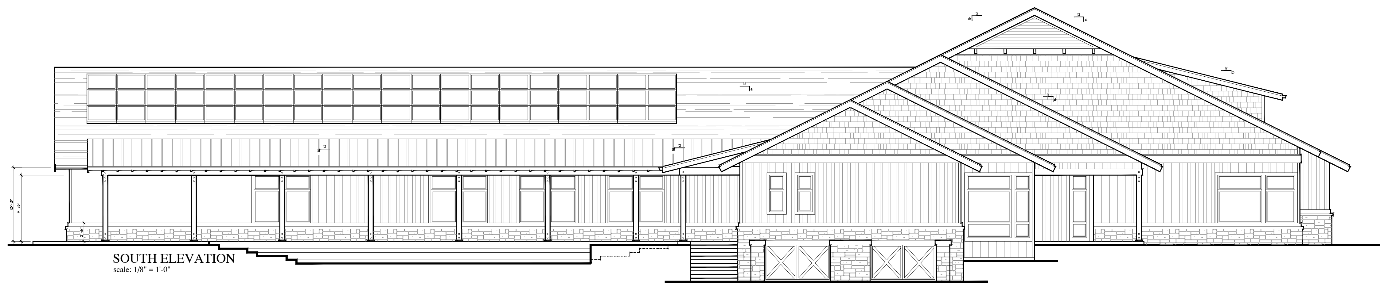
SOUTH ELEVATION scale: 1/8" = 1'-0"