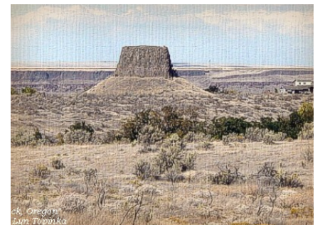
Hat Rock, east of Umatilla, is the remains of a basalt cinder cone, scoured by rushing flood waters.

Pardee discovered giant ripple marks in an area that was once occupied by glacial Lake Missoula. These ripple marks were huge versions of the ripples you might see at the beach or river. They are 15-30 feet high and had a wavelength of 250 feet. These ripple marks are evidence that deep and swift flowing currents passed through this area. Pardee said they were formed by a sudden failure of the ice dam that held back Lake Missoula.