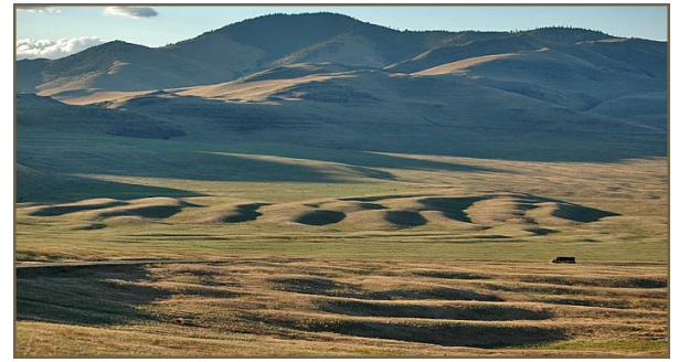
The giant ripples at Camas Prairie were ground breaking evidence of a massive glacial lake and flood.

Geologists are really detectives. They observe the landscape around them, searching for clues about what happened in the past to form the landscape we see today. This is what geologist J. Harlen Bretz was doing over 100 years ago when he was trying to figure out what formed the unusual, scarred and rocky landscape of eastern Washington.