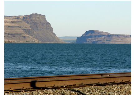
Flood waters passing Wallula Gap reached 1,200 feet. Glacial erratics, evidence of the flood, were left stranded on the slopes of the Horse Heaven Hills and nearby ridges.

Other geologists at the time didn't believe Bretz's hypothesis. Geologists at the time tended to believe past geological events could only be explained by forces observable today. Since a flood the size Bretz suggested had never been seen, his idea was considered impossible. To make matters worse, Bretz could not identify what would have been the source of such a gigantic flood.