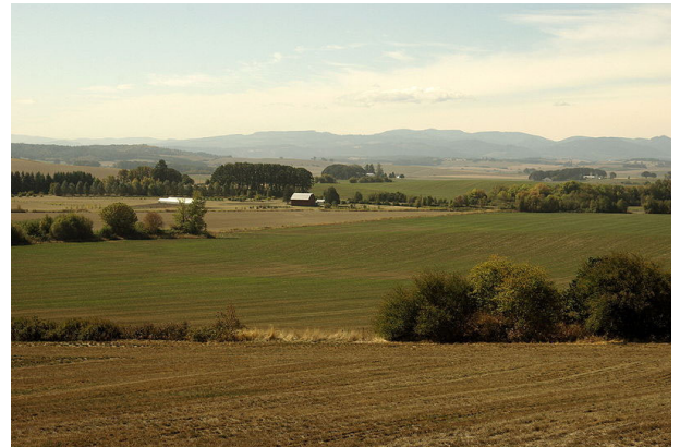
Farmland in the Willamette Valley owes its rich soil to the Missoula Floods.

As the flood water thundered through the Columbia Plateau of eastern and central Washington, it scoured away much of the area's topsoil. When the floods reached Portland and the mouth of the Willamette River, some of the flood waters (full of top soil) backed up into the Willamette Valley and created Lake Allison.